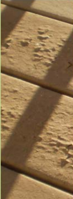
Endeck Capped Cellular PVC Decking