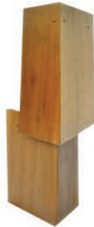
Pre-made Mitered Corners